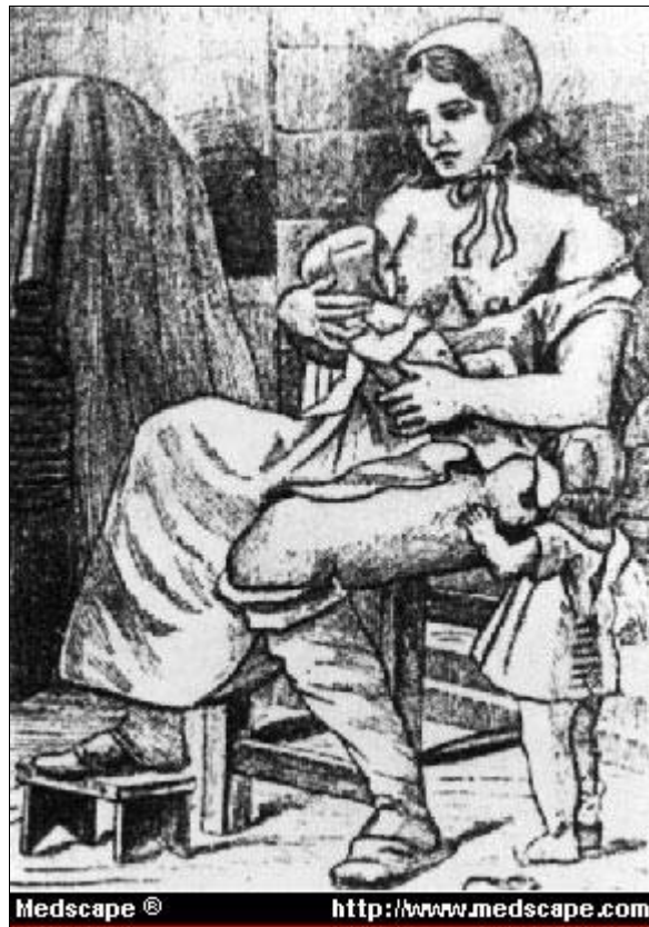
Figure 4. Old woodcut representing polymastia.